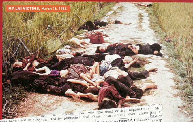
MY LAI VICTIMS, March 16, 1968