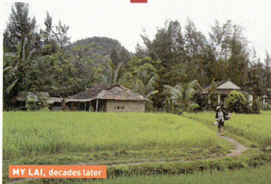
MY LAI, decades later

My Lai may have been an aberration, as many believed. But with the U.S. at war in Afghanistan and Iraq following the terrorist attacks of Sept. 11, 2001, American troops are once again finding themselves in treacherous combat situations like those in Vietnam—fighting enemies who look and