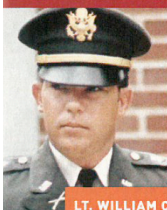
LT. WILLIAM CALLEY, who led the unit that committed the killings, was convicted by a military court of murder.